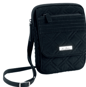
Mini Hipster #12730 6" x 7 1/2" x 3/4" 53" adjustable strap zip and magnetic snap closures suggested retail $58