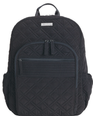
Campus Backpack #13117 12" x 16" x 6 1/2" 2 3/4" handle drop 28 1/2" adjustable straps zip closures suggested retail $129