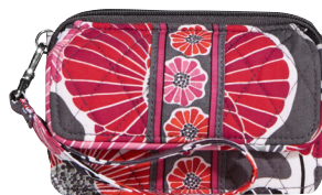
All in One Crossbody #13037 5 1/2" x 3 1/2" x 2" 52" removable, adjustable strap 6" removable wrist strap zip and magnetic snap closures suggested retail $54