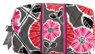
Medium Cosmetic #10385 8" x 4 1/4" x 2 1/4" zip closure suggested retail $26