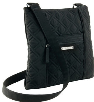
Hipster #12433 11" x 11" x 1 3/4" 52" adjustable strap zip closure suggested retail $70