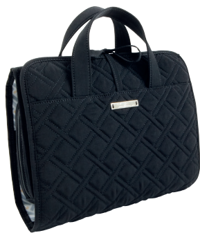
Hanging Organizer #12446 11 1/2" x 29 1/4" x 2 1/2" 4 1/2" handle drop tie closure suggested retail $58