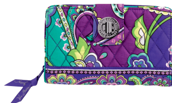
Turn Lock Wallet #10913 7 3/4" x 4 3/4" turnlock and zip closures suggested retail $49