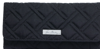
Trifold Wallet #13966 8 1/4" x 4" x 3/4" hidden magnetic closure suggested retail $48