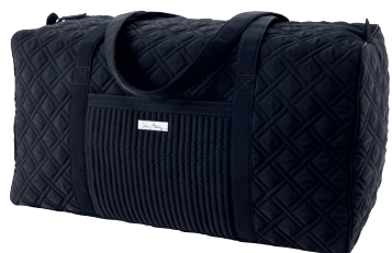
Large Duffel #12727 22" x 11 1/2" x 11 1/2" 15" strap drop zip closure suggested retail $99