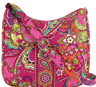
Carryall Crossbody #13502 10 3/4" x 9 3/4" x 5 1/4" 52" adjustable strap zip closure suggested retail $72