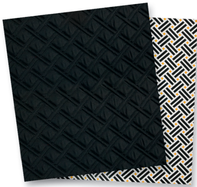
Classic Black #081

With elevated accents for any holiday wardrobe, bright reds and timeless pinks whirl on a winter-gray backdrop. The structured floral motifs create a festive, contemporary aesthetic. Petite versions of the pink, red and black blooms adorn the lining.