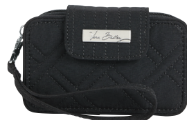
Smartphone Wristlet 2.0 #13964 5 1/2" x 3 1/4" x 1 3/4" 6" wrist strap pin snap and zip closures suggested retail $54