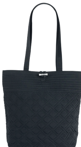
Tote #12738 11 3/4" x 13 1/2" x 4" 12 1/2" strap drop toggle closure suggested retail $59