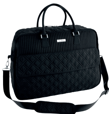
Grand Traveler #12723 21" x 14 1/2" x 9 1/2" 7" strap drop 52 1/2" removable, adjustable strap zip closure suggested retail $149