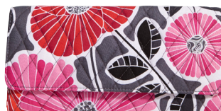
Trifold Wallet #13947 8 1/4" x 4" x 3/4" hidden magnetic closure suggested retail $42