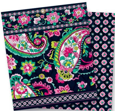
Petal Paisley #154