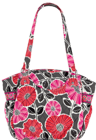
Glenna #12558 14 1/2" x 11 3/4" x 6" 11" strap drop zip closure suggested retail $80