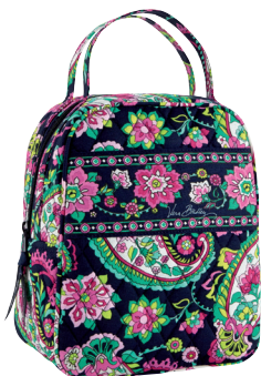
Lunch Bunch #12370 7 1/2" x 9" x 4 1/4" 3" handle drop zip closure suggested retail $34