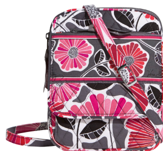
Mini Hipster #12468 6" x 7 1/2" x 3/4" 53" adjustable strap zip and magnetic snap closures suggested retail $50