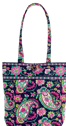
Tote #10449 11 3/4" x 13 1/2" x 4" 12 1/2" strap drop toggle closure suggested retail $49