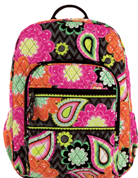
Campus Backpack #12470 12" x 16" x 6 1/2" 2 3/4" handle drop 28 1/2" adjustable straps zip closure suggested retail $109