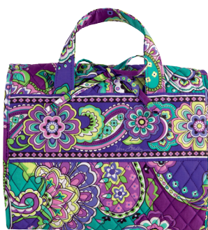
Hanging Organizer #11026 11 1/2" x 29 1/4" x 2 1/2" tie closure suggested retail $48