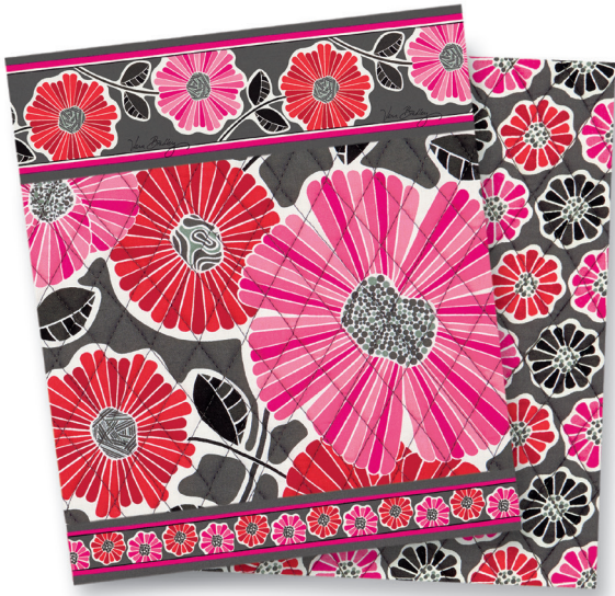
Cheery Blossoms #170