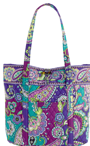
Vera #10096 19 1/4" x 14 3/4" x 6 1/4" 11" strap drop toggle closure suggested retail $86