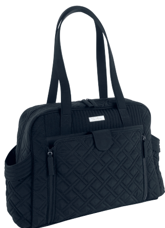
Make a Change Baby Bag #12879 16 1/2" x 12" x 7 1/2" 15" strap drop 15 3/4" x 23 3/4" changing pad zip and hidden magnetic closures suggested retail $138