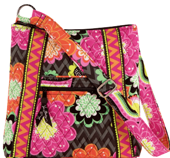
Hipster #11262 11" x 11" x 1 3/4" 52" adjustable strap zip closure suggested retail $60