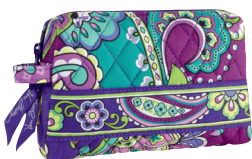
Small Cosmetic #10107 7" x 4" x 1 1/4" zip closure suggested retail $22