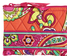
Coin Purse #10136 5 1/4" x 4" zip closure suggested retail $14 not available in Cheery Blossoms