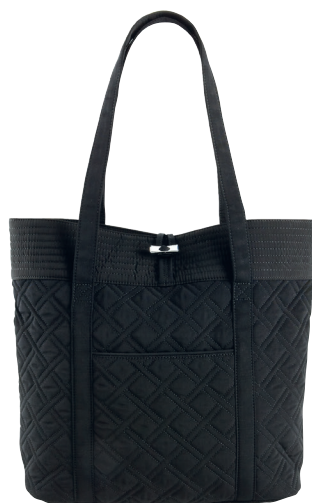
Vera #12741 19 1/4" x 14 3/4" x 6 1/4" 11" strap drop toggle closure suggested retail $99