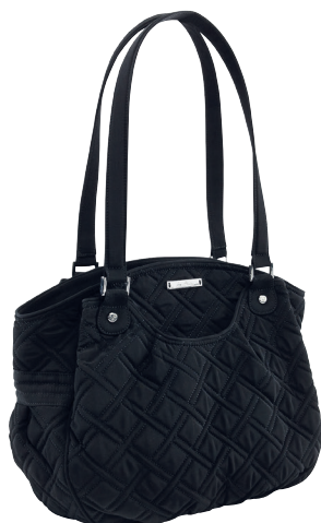
Glenna #12518 14 1/2" x 11 3/4" x 6" 11" strap drop zip closure suggested retail $95