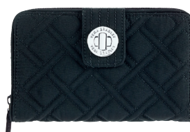
Turn Lock Wallet #12740 7 3/4" x 4 3/4" turnlock and zip closures suggested retail $57