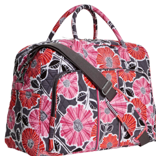
Weekender #12479 18 1/2" x 12 1/2" x 8" 6 1/2" strap drop 48 1/2" removable, adjustable strap zip closure suggested retail $98