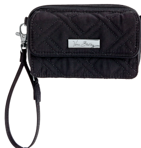
All in One Crossbody #13114 5 1/2" x 3 1/2" x 2" 52" removable, adjustable strap 6" removable wrist strap zip and magnetic snap closures suggested retail $64