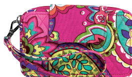
Smartphone Wristlet 2.0 #13946 5 1/2" x 3 1/4" x 1 3/4" 6" wrist strap zip and pin snap closures suggested retail $48