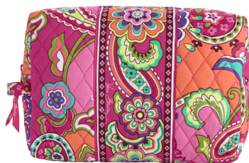
Large Cosmetic #10108 10" x 6 1/4" x 3 1/4" zip closure suggested retail $30