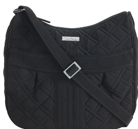
Carryall Crossbody #13543 10 3/4" x 9 3/4" x 5 1/4" 52" adjustable strap zip closure suggested retail $78