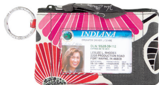
Zip ID Case #10125 5" x 3" zip closure suggested retail $12