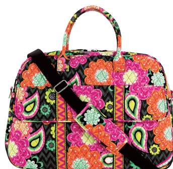
Grand Traveler #11889 21" x 14 1/2" x 9 1/2" 7" strap drop 52 1/2" removable strap zip closure suggested retail $120