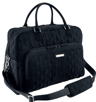
Weekender #12435 18 1/2" x 12 1/2" x 8" 6 1/2" strap drop 48 1/2" removable, adjustable strap zip closure suggested retail $140