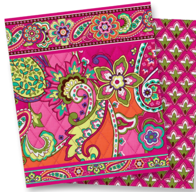
Pink Swirls #179