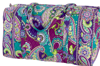
Large Duffel #10139 22" x 11 1/2" x 11 1/2" 15" strap drop zip closure suggested retail $85