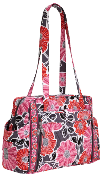
Make a Change Baby Bag #12485 16 1/2" x 12" x 7 1/2" 15" strap drop 15 3/4" x 23 3/4" changing pad zip and hidden magnetic closures suggested retail $118