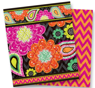
Ziggy Zinnia #163