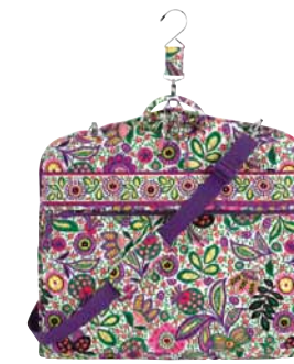
Garment Bag #10618 23" x 43 1/2" 45 1/2" removable strap suggested retail $135 M