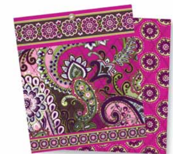
Very Berry Paisley #063 (Fall 2010)