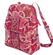
Backpack #10620 9 3/4" x 12 1/2" x 4 1/4" 31 1/4" adjustable straps suggested retail $88 M