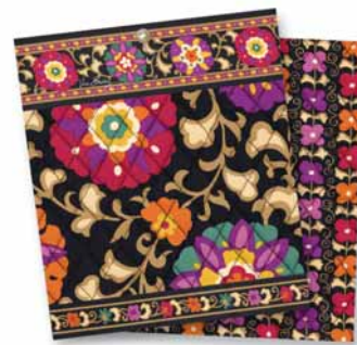
Suzani #115 (Winter 2011)