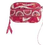
Tech Case #10490 5" x 3 1/4" x 1/2" 6" removable wrist strap suggested retail $25 M