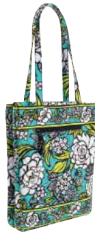
NEW! Laptop Travel Tote #12138 11 1/4" x 14 3/4" x 3" 12" strap drop suggested retail $85 S