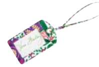
Luggage Tag #11605 4 1/2" x 2 3/4" suggested retail $12 W