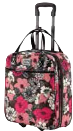
17" Roll Along Tote #11536 17" x 14" x 7 1/2" suggested retail $220