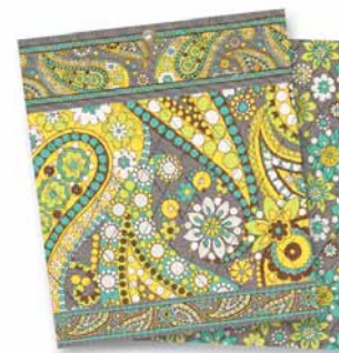
Lemon Parfait #108 (Spring 2011)