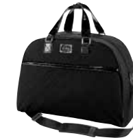
New! Travel Overnighter #12159 20" x 14" x 9" 5 1/2" handle drop 52" removable, adjustable shoulder strap suggested retail $182