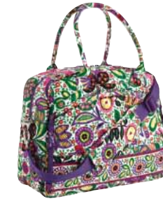
Metropolitan #11266 14 3/4" x 12" x 6" 53" removable strap suggested retail $99 H