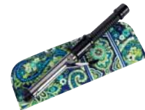
Curling Iron Cover #10106 4 1/2" x 12 1/2" suggested retail $20 M