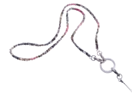
Chain Lanyard #11888 38" total length suggested retail $15 S