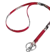
Lanyard #10887 18 1/2" x 1/2" neck strap (pack of 6) suggested retail $12 each W