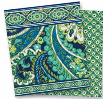
Rhythm & Blues #113 (Winter 2011)