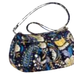
Frannie #11022 9 1/2" x 5 1/4" x 3" 50 1/2" adjustable strap suggested retail $29 M