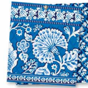
Blue Lagoon #104 (Spring 2011)