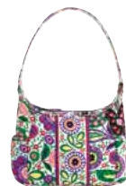
Sophie #11607 9" x 5 3/4" x 3 1/2" 9" strap drop suggested retail $44 M