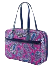
New! Companion Attaché #12158 12" x 17" x 5" 10 1/2" strap drop suggested retail $172