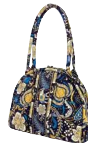
Eloise #11449 13 1/4" x 9 3/4" x 4 1/2" 9 1/2" strap drop suggested retail $74 S