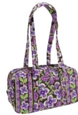
100 Handbag #11811 11 1/4" x 6" x 5 1/2" 12" strap drop suggested retail $52 M