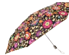
Umbrella #11495 11" closed suggested retail $32 W