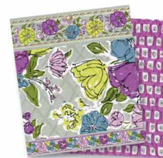
Watercolor #107 (Summer 2011)