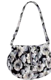
Saddle Up #10813 14" x 9 3/4" x 4" 50" adjustable strap suggested retail $68 M