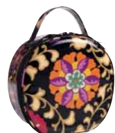
Hatbox Cosmetic #11999 7 1/4" x 7" x 3 1/2" suggested retail $46 S