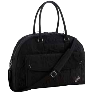
Overnighter #11852 20 1/4" x 14" x 9" 9" strap drop 55 1/4" removable, adjustable strap suggested retail $140 S