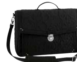
Laptop Attaché #11853 17" x 11 1/2" x 5 1/4" 1 3/4" handle drop 45" removable, adjustable strap suggested retail $120 S