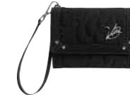
Flap All in One #11849 5 1/4" x 3 3/4" x 1 1/4" 6" removable wrist strap suggested retail $40 S