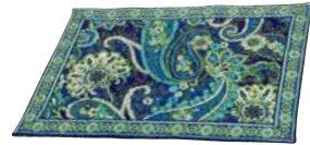
Placemat #10143 19" x 13 1/2" suggested retail $12 M