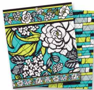
Island Blooms #120 (Spring 2012)