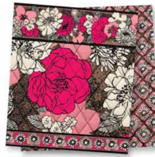
Mocha Rouge #110 (Fall 2011)