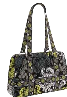
Squared Away #11281 15 1/4" x 9 3/4" x 4 1/2" 12" strap drop suggested retail $68 M