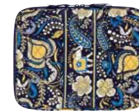
Laptop Sleeve #11484 14" x 10 3/4" x 1" suggested retail $38 M