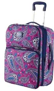
22" Expandable Upright #11534 22" x 14" x 9" + 2 1/2" exp. suggested retail $280