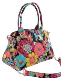
Chain Bag #11810 13" x 8 1/2" x 5" 7" strap drop 34 3/4" detachable chain strap suggested retail $78 S