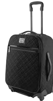
22" Spinner #11858 13 1/4" x 21 1/2" x 9" suggested retail $300