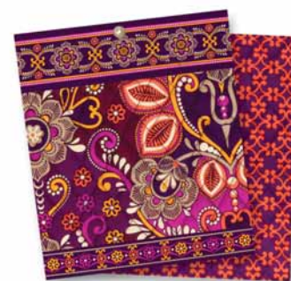
Safari Sunset #112 (Fall 2011)