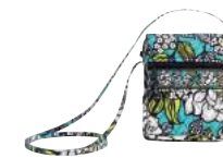
Mini Hipster #10334 6" x 8" x 1/2" 59 1/4" adjustable strap suggested retail $45 M