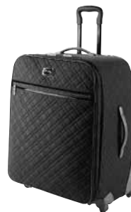
27" Spinner #11537 27" x 18 1/2" x 11" suggested retail $340