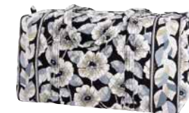
Large Duffel #10139 22" x 11 1/2" x 11 1/2" 15" strap drop suggested retail $85 M