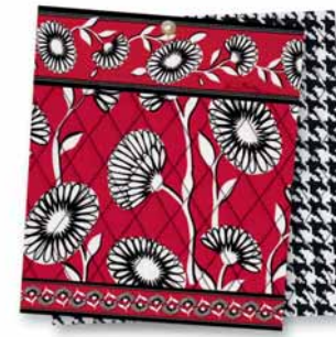
Deco Daisy #106 (Summer 2011)