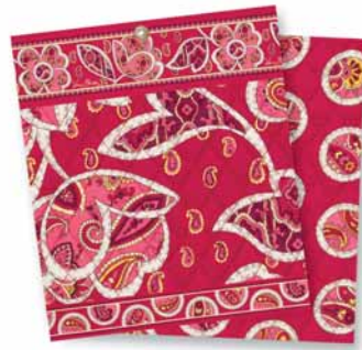
Rosy Posies #121 (Spring 2012)