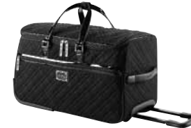
22" Roll Along Duffel #11540 12 1/4" x 22" x 10 1/4" suggested retail $220