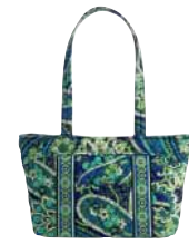
Little Mandy #12002 10 1/2" x 8" x 3 3/4" 10" strap drop suggested retail $59 M