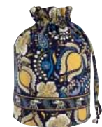
Ditty Bag #10132 8 1/2" x 13 1/2" suggested retail $28 M