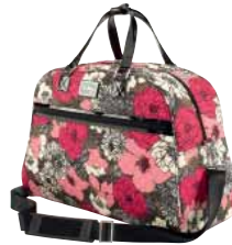
New! Travel Overnighter #12156 20" x 14" x 9" 5 1/2" handle drop 52" removable, adjustable shoulder strap suggested retail $182