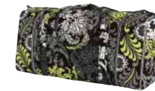
Small Duffel #10138 18 3/4" x 8 1/4" x 8 1/2" 15" strap drop suggested retail $69 M