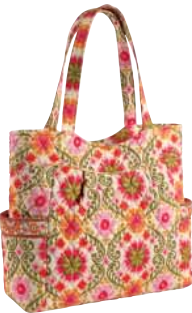
Pleated Tote #10812 14 3/4" x 14" x 5 1/4" 10 1/2" strap drop suggested retail $80 M