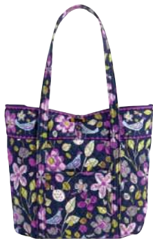
Vera #10096 19 1/4" x 14 3/4" x 6 1/4" 11" strap drop suggested retail $80 M