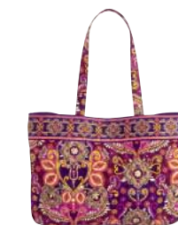
East West Tote #11883 18" x 11 1/4" x 3 3/4" 11" strap drop suggested retail $52 M