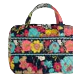
Lunch Date #11885 9 1/2" x 7" x 6 1/2" 3" handle drop suggested retail $34 S