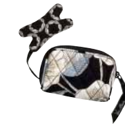
New! Tune In #12040 4" x 2 1/2" x 3/4" suggested retail $16 S