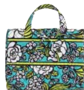
Hanging Organizer #11026 11 1/2" x 29 1/4" x 2 1/2" suggested retail $48 M