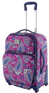
22" Spinner #11857 13 1/4" x 21 1/2" x 10 1/2" suggested retail $300