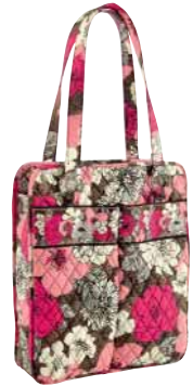
Perfect Pocket Tote #11352 12" x 14 1/2" x 3" 10 1/2" strap drop suggested retail $62 M