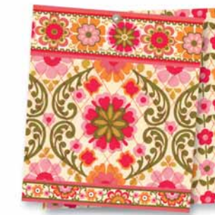
Folkloric #105 (Spring 2011)