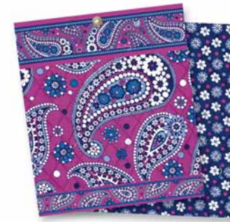
Boysenberry #102 (Spring 2011)