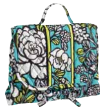
NEW! Essentials Cosmetic #12182 9" x 6 1/4" x 1 1/2" suggested retail $38 M