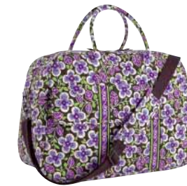
Grand Traveler #11889 21" x 14 1/2" x 9 1/2" 7" strap drop 52 1/2" removable strap suggested retail $118 M