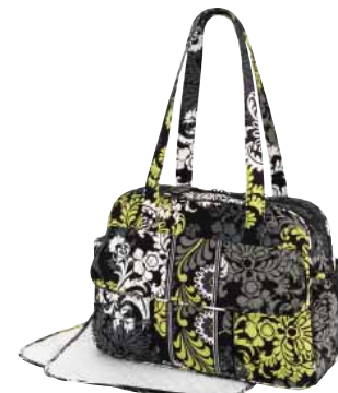
Baby Bag #10619 16" x 11 3/4" x 5 1/2" 12" strap drop 26" x 14" changing pad suggested retail $99 M