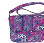
Rachel #11448 8 3/4" x 6 3/4" x 3" 57" adjustable strap suggested retail $54 S