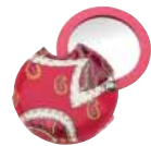
NEW! Compact Mirror #12186 (pack of 8) 3 1/2" x 1 1/2" suggested retail $14 W