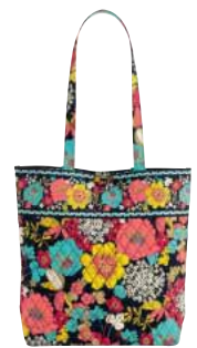
Tote #10449 11 3/4" x 13 1/2" x 4" 12 1/2" strap drop suggested retail $49 M