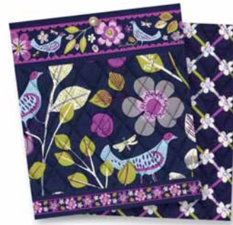
Floral Nightingale #116 (Winter 2011)