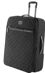
28" Expandable Upright #11538 28" x 18 1/4" x 11" + 2 1/2" exp. suggested retail $320