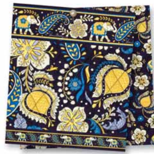
Ellie Blue #119 (Spring 2012)