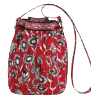
Quick Draw #11602 9 1/2" x 13" x 5 1/4" 52" adjustable strap suggested retail $78 S