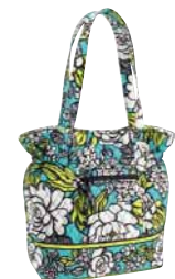
NEW! Laura #12167 10 3/4" x 13" x 5" 11 1/2" strap drop suggested retail $60 M