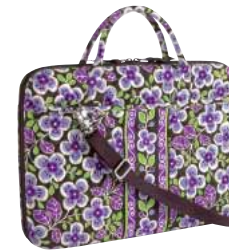
Laptop Portfolio #10611 17" x 12" x 2 1/2" 3 1/2" handle drop 48" removable strap suggested retail $82 S