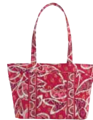
Mandy #11450 12" x 9 3/4" x 4 3/4" 11" strap drop suggested retail $68 M