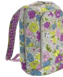
Laptop Backpack #11265 11 1/2" x 15 3/4" x 7" 28 1/2" adjustable straps suggested retail $99 H