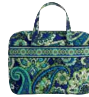
Good Book Cover #12003 10 1/4" x 7 1/2" x 2" suggested retail $32 M