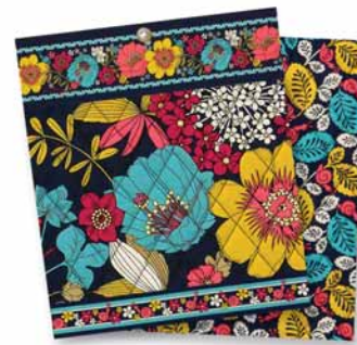
Happy Snails #111 (Fall 2011)