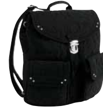
Backpack #11860 10 1/2" x 13" x 4 1/4" 32 1/4" adjustable straps suggested retail $105 S