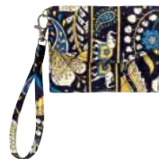
NEW! Phone Wristlet #12133 4 3/4" x 3 3/4" x 1/2" 6" removable wrist strap suggested retail $34 S