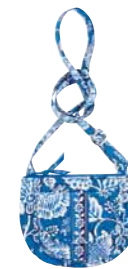
Lizzy #11451 9 1/4" x 7" 58" adjustable strap suggested retail $46 M