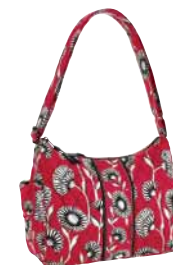
On The Go #10076 11" x 8 3/4" x 4 1/4" 41" adjustable strap suggested retail $65 M