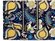
NEW! Large Folio #12134 12" x 9 1/4" suggested retail $40 S