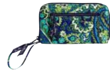
Zip-Around Wallet #10112 7 1/2" x 4 3/4" 6" wrist strap suggested retail $39 S