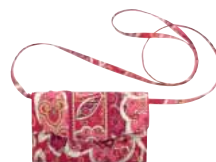
new! Strap Wallet #12179 7 1/2" x 4 3/4" 54" removable strap suggested retail $48 S