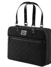
Companion Attaché #11542 12" x 17" x 5" 10 1/2" strap drop suggested retail $172