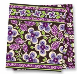
Plum Petals #117 (Fall 2011)