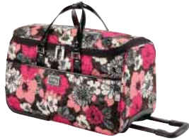
22" Roll Along Duffel #11535 12 1/4" x 22" x 10 1/4" suggested retail $220