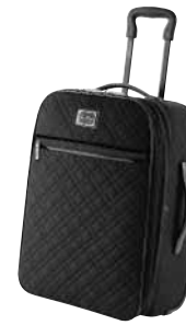
22" Expandable Upright #11539 22" x 14" x 8 1/2" + 2 1/2" exp. suggested retail $280