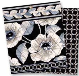
Camellia #118 (Spring 2012)