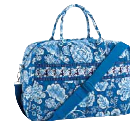
Weekender #10445 18 1/2" x 12 1/2" x 8 1/2" 6 1/2" handle drop 48 1/2" removable strap suggested retail $94 M