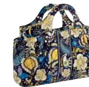
New! Abby #12177 13" x 8 1/4" x 4" 3" handle drop suggested retail $68 S