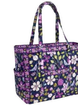
Get Carried Away Tote #11024 18 1/4" x 15 1/2" x 7 1/2" 12 1/2" strap drop suggested retail $92 M