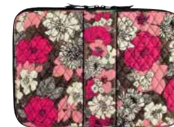
17" Laptop Sleeve #11884 17" x 11 3/4" x 1" suggested retail $45 M