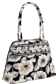
NEW! Bowler #12175 14 1/2" x 10 1/4" x 5" 9 1/2" strap drop suggested retail $85 M