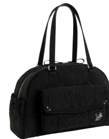
Bowler Baby Bag #11862 18" x 11 1/4" x 7 1/4" 11" strap drop suggested retail $125 S