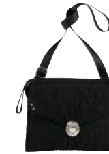
Pushlock Crossbody #11854 10 3/4" x 8 1/2" x 1 1/2" 52" adjustable strap suggested retail $70 S