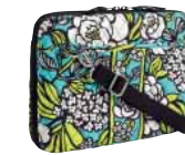
Mini Laptop Case #10962 11 1/2" x 8" x 2" 48" removable strap suggested retail $52 S