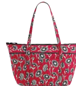
Miller Bag #10141 24" x 13 1/2" x 8" 13" strap drop suggested retail $85 M