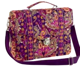
Attaché #11886 14 1/2" x 11" x 4" 3 1/2" handle drop 52 1/2" adjustable, removable strap suggested retail $88 S