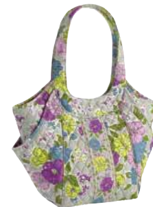
Side by Side #11264 18" x 11 1/2" x 5 1/2" 10 1/2" strap drop suggested retail $68 M