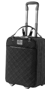
17" Roll Along Tote #11541 17" x 14" x 7 1/2" suggested retail $220