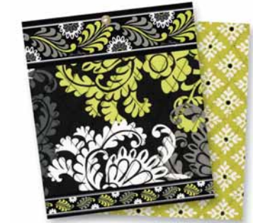
Baroque #069 (Winter 2010)