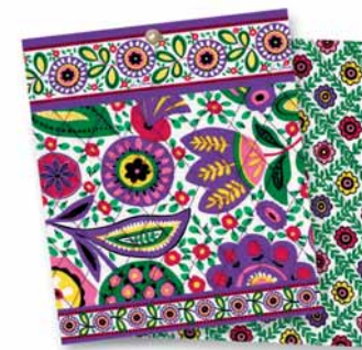
Viva la Vera #109 (Summer 2011)