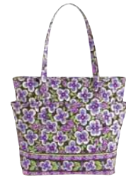
Go Round Tote #11882 13 1/4" x 14 1/4" x 4 1/4" 10 1/2" strap drop suggested retail $84 M