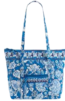
Villager #10326 16" x 12 1/4" x 4" 11 3/4" strap drop suggested retail $72 M