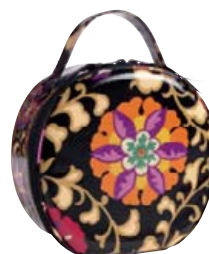
Hatbox Cosmetic #11999 7 ¼" x 7" x 3 ½" zip closure suggested retail $46 (S)