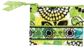
Coin Purse #10136 5 1/4" x 4" zip closure suggested retail $14 M