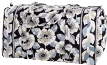
Large Duffel #10139 22" x 11 1/2" x 11 1/2" 15" strap drop zip closure suggested retail $85 (M)