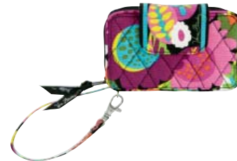
NEW! July 10 Smartphone Wristlet #12423 5 1/2" x 3 1/4" x 2" 6" wrist strap magnetic snap closure and zip suggested retail $49 S