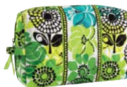
Large Cosmetic #10108 10" x 6 ¼" x 3 ¼" zip closure suggested retail $30 (M)