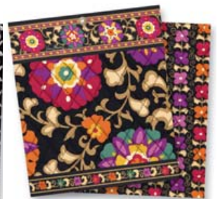
Suzani #115 (Winter 2011)