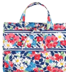
Hanging Organizer #11026 11 ½" x 29 ¼" x 2 ½" tie closure suggested retail $48 (M)