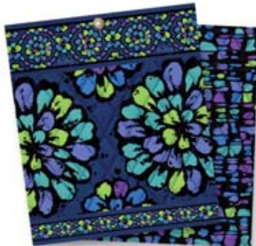
Indigo Pop #126 (Fall 2012)