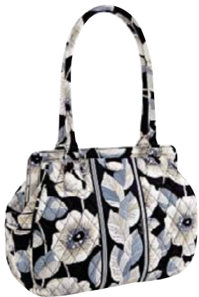
Frame Bag #12299 13" x 10" x 4" 9" strap drop hidden magnetic closure suggested retail $94 S