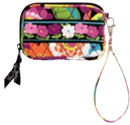
Tech Case #10490 5" x 3 1/4" x 1/2" 6" removable wrist strap zip closure suggested retail $25 M