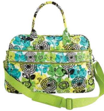
Weekender #10445 18 1/2" x 12 1/2" x 8 1/2" 6 1/2" handle drop 48 1/2" removable strap zip closure suggested retail $94 (M)