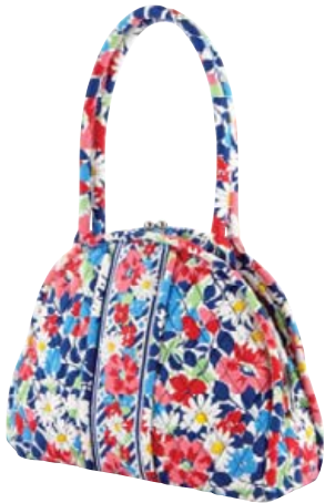
Eloise #11449 13 ¼" x 9 ¾" x 4 ½" 9 ½" strap drop kisslock closure suggested retail $75 S