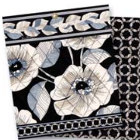
Camellia #118 (Spring 2012)