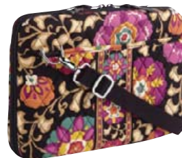
Mini Laptop Case #10962 11 ½" x 8" x 2" 48" removable strap zip closure suggested retail $54 S