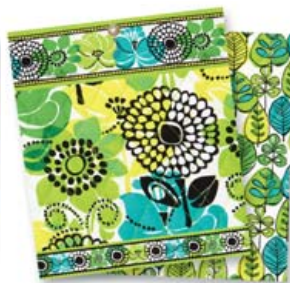
Lime's Up #123 (Summer 2012)