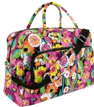
NEW! August 30 Weekender #12479 18 1/2" x 12 1/2" x 8" 6 1/2" handle drop 48 1/2" adjustable, removable strap zip closure suggested retail $98 (M)