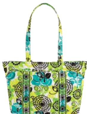
Mandy #11450 12" x 9 ¾" x 4 ¾" 11" strap drop zip closure suggested retail $70 M