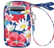
All in One Wristlet #10489 3" x 5 1/4" x 3/4" 6" wrist strap zip closure suggested retail $36 M