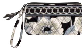
Wristlet #12180 7 1/4" x 4" x 1" 6" wrist strap zip closure suggested retail $34 M