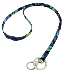
NEW! July 10 Breakaway Lanyard #12476 18 ½" x ½" suggested retail $16 (W)