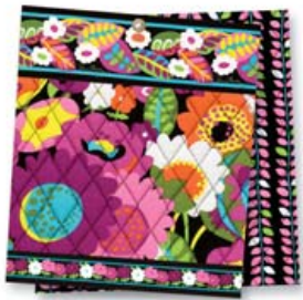
Va Va Bloom #127 (Fall 2012)