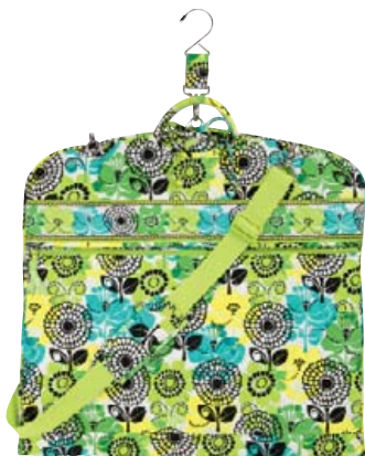
Garment Bag #10618 23" x 43 1/2" 45 1/2" removable strap zip closure suggested retail $135 (M)