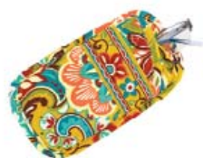
Double Eye #10872 4" x 7 ¼" suggested retail $22 (M)