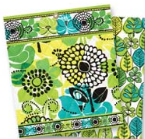
Lime's Up #123 (Summer 2012)