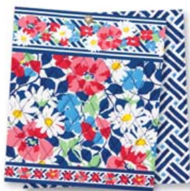
Summer Cottage #125 (Summer 2012)