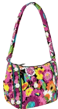
NEW! July 10 On the Go #12469 11 ½" x 8 ½" x 4 ¼" 53" adjustable strap zip closure suggested retail $70 M