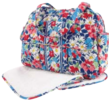
Baby Bag #10619 16" x 11 ¾" x 5 ½" 12" strap drop 26" x 14" changing pad zip closure suggested retail $99 M