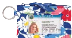
Zip ID Case #10125 5" x 3" zip closure suggested retail $12 (M)