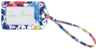
Luggage Tag #11605 4 1/2" x 2 3/4" suggested retail $12 (W)