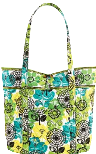
Vera #10096 19 ¼" x 14 ¾" x 6 ¼" 11" strap drop toggle closure suggested retail $86 M