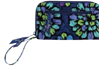
Zip-Around Wallet #10112 7 1/2" x 4 3/4" 6" wrist strap zip closure suggested retail $39 S