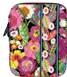
Tablet Sleeve #12038 8" x 10 ¼" x ¾" zip closure suggested retail $38 M