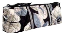
Brush & Pencil #12168 9" x 3" x 2" zip closure suggested retail $26 (M)