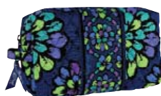
Medium Cosmetic #10385 8" x 4 ¼" x 2 ¼" zip closure suggested retail $26 (M)