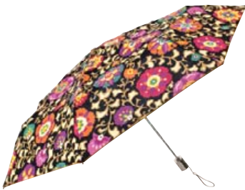
Umbrella #12292 11" closed suggested retail $34 (W)