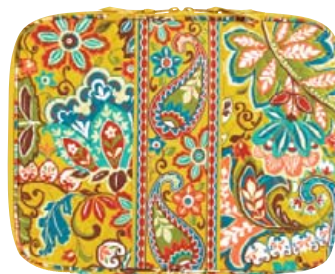
Laptop Sleeve #11484 14" x 10 ¾" x 1" zip closure suggested retail $38 M