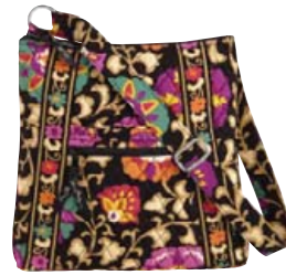
Hipster #11262 11" x 11" x 1 ¾" 52" adjustable strap zip closure suggested retail $60 M