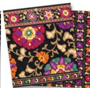
Suzani #115 (Winter 2011)