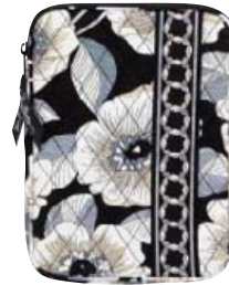
E-Reader Sleeve #11485 6 ¼" x 8 ½" x ¾" zip closure suggested retail $34 M