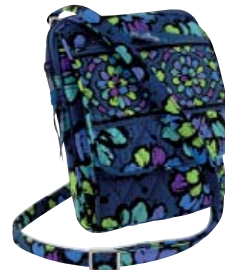
NEW! July 10 Mini Hipster #12468 6" x 7 ½" x ¾" 53" adjustable strap magnetic snap and zip closure suggested retail $50 M