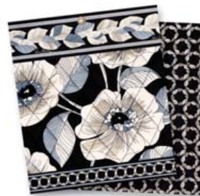
Camellia #118 (Spring 2012)