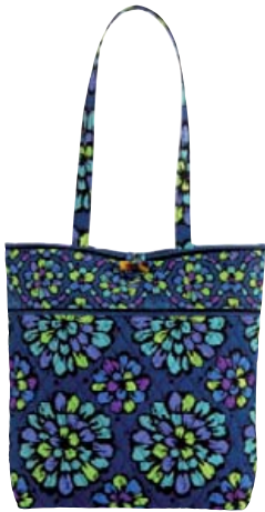
Tote #10449 11 ¼" x 13 ½" x 4" 12 ½" strap drop toggle closure suggested retail $49 M