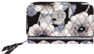
Turn Lock Wallet #10913 7 3/4" x 4 3/4" turn lock and zip closure suggested retail $49 S