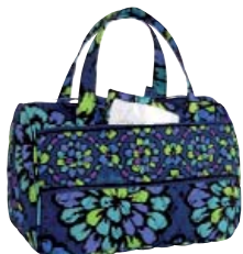
Lunch Date #11885 9 ½" x 7" x 6 ½" 3" handle drop zip closure suggested retail $34 S